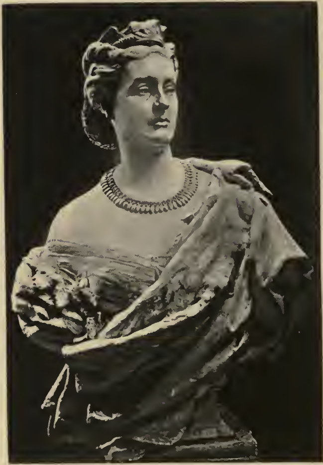
Princess Mathilde. (From the bust by Carpeaux.)